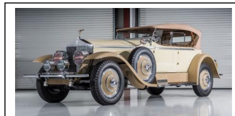
A Brewster bodied 1929 Ascot