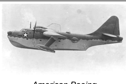
American Boeing XPBB-1 Ranger