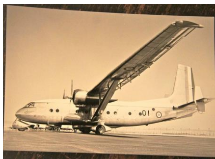
French Hurel Dubois Hd 321