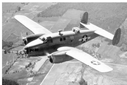
American Fairchild AT-21 Gunner