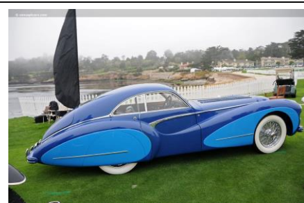
French 1948 Talbot Lago T26