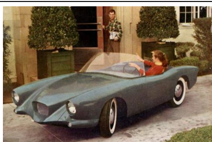
French 1953 Panhard Darrin