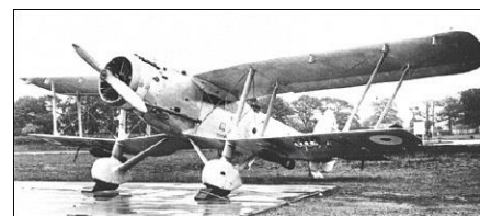
British Vickers Type 253